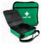
Lyon Bag (empty)